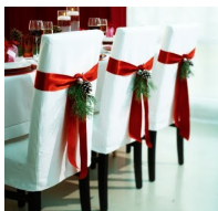
PROGRESSIVE DINNER... December 3rd RSVP today!