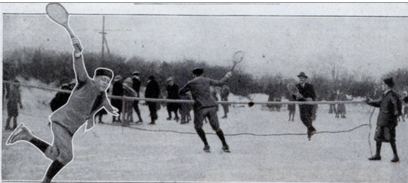
PLAY TENNIS ON SKATES IN ILLINOIS

As I continue to search for new ways to keep this Club active and busy all year long...I came across something that might just work...tennis on skates anyone :) ?