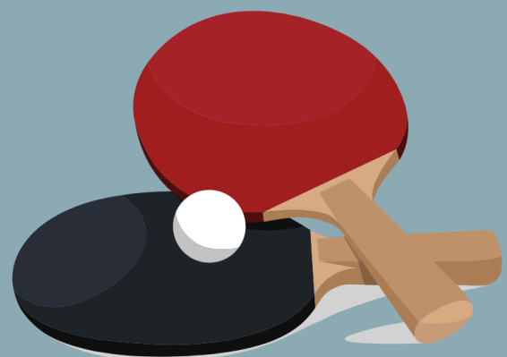
TABLE TENNIS UPSTAIRS, DART BOARD DOWNSTAIRS (DARTS CAN BE GRABBED FROM BAR), SPORTS GAMES ON THE TV, WING OF THE WEEK SPECIALS, CARDS, BYO BOARD GAMES, OR WATCH SOME LIVE SQUASH... LET'S HAVE A FUN NIGHT AT THE CLUB!